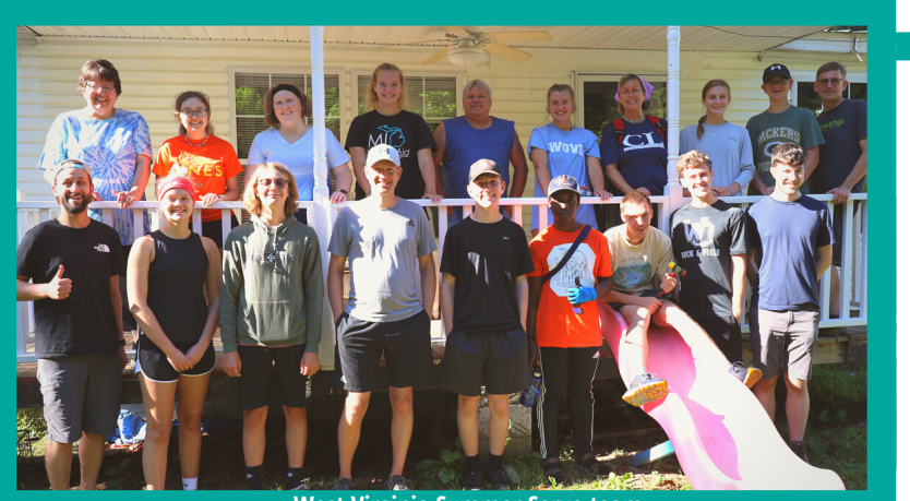
West Virginia Summer Serve team